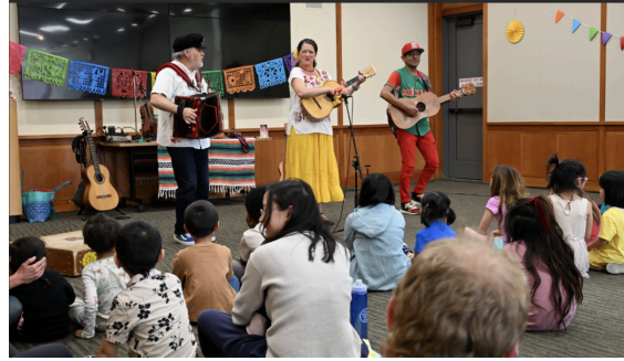
Día de los Niños on April 18