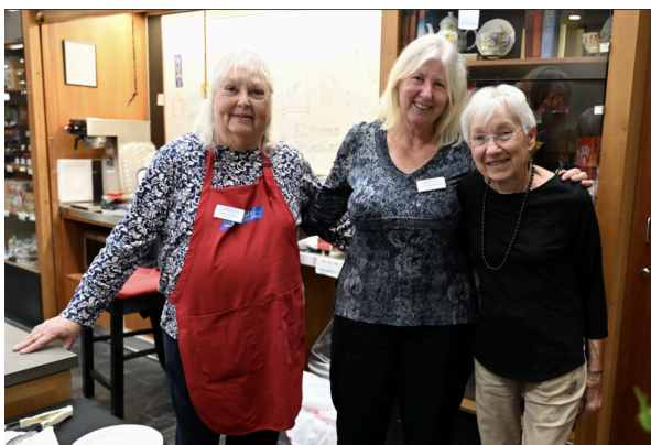
Live @ the Library on April 11